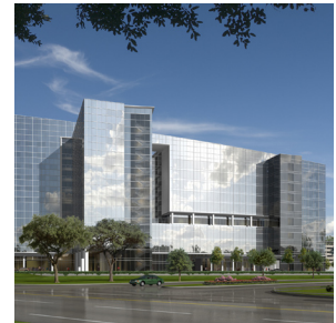
Baylor College of Medicine Clinic & Hospital Campus