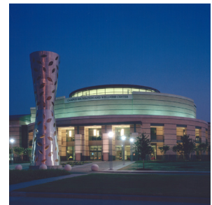
U of H Science, Engineering & Classroom Building