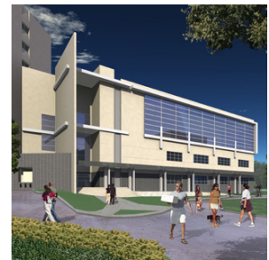
UT SW Medical Center Clean Rodent Housing/BSL-3 Lab